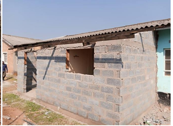
Mounting timber for roofing