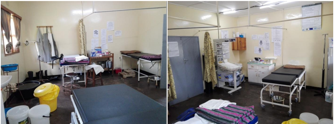
Small and clouded labour room before expansion and renovation