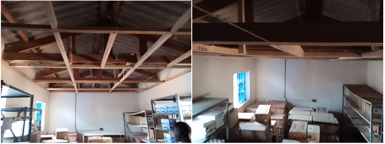
Roof prepared for ceiling board installation