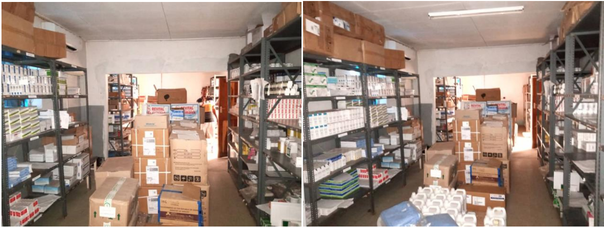
Pharmacy expansion completed. Drugs well stocked on the created shelves though some are still on the floor palates. We would have loved to create shelves too on the middle; the money accomplished what we budgeted for.

The completion of the project has been delayed because of Covid-19. The project did not commence immediately we received the money. However we are very grateful for your support for achieving so much with us because of your generous support. May God who sees what is done in secret richly bless you. Thank you so much.