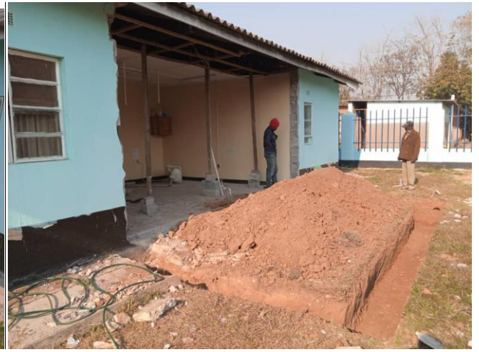
Foundation for the expansion of the Labour Ward is laid