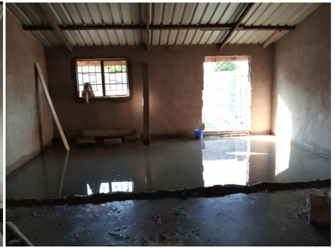
Plastering the expanded labour ward